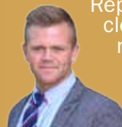
Boomer Birch Beef Sire Analyst

“Cincinnati is exceptional. His unbelievable growth and weight gain is complemented by style and thickness throughout. His EBVS excel with calving ease figures of + 3.3 ranking him in the top 10% of the breed. With a Terminal Production index + 85 and a Self Replacing index of +105 it is clear to see that this bull is not only a physical giant he is also a performance giant.”