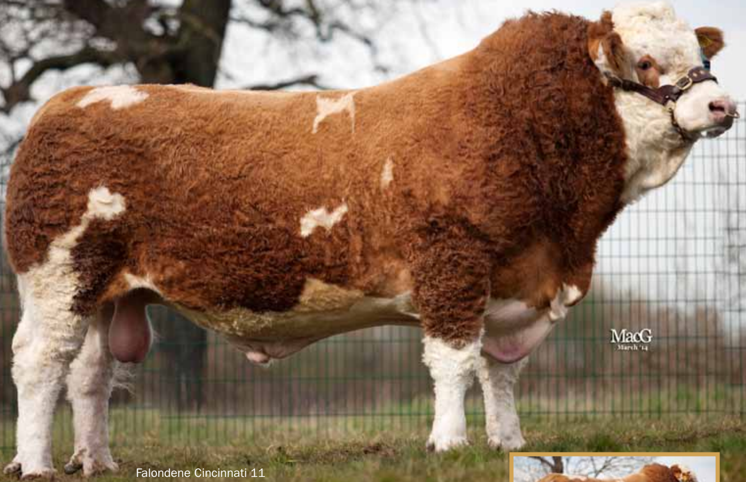
Falondene Cincinnati 11