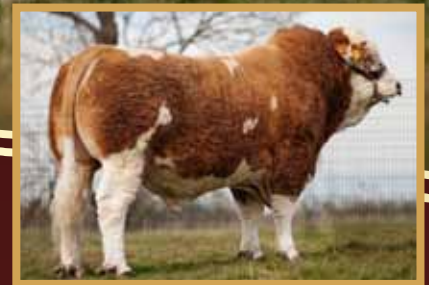
Falondene Cincinnati 11