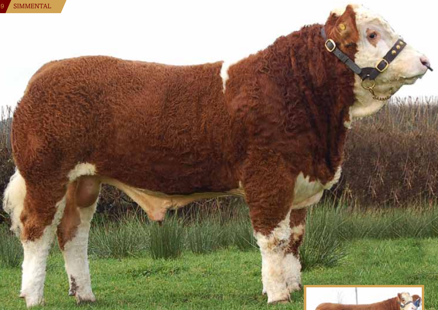
Popes Barclay 10