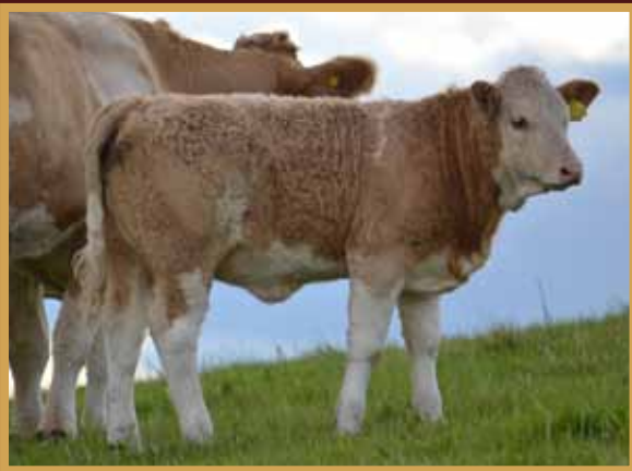
Barclay daughter Strathisla Evita's Twiggy

Style, performance & depth of pedigree with maternal EBV's