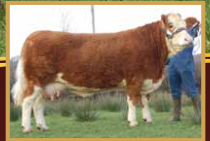
Dam: Popes Nelly 2nd