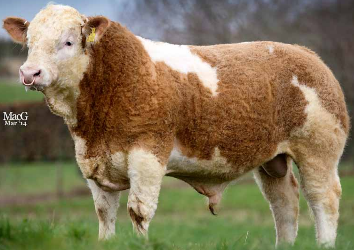
Barkley son Strathisla Ensign 13